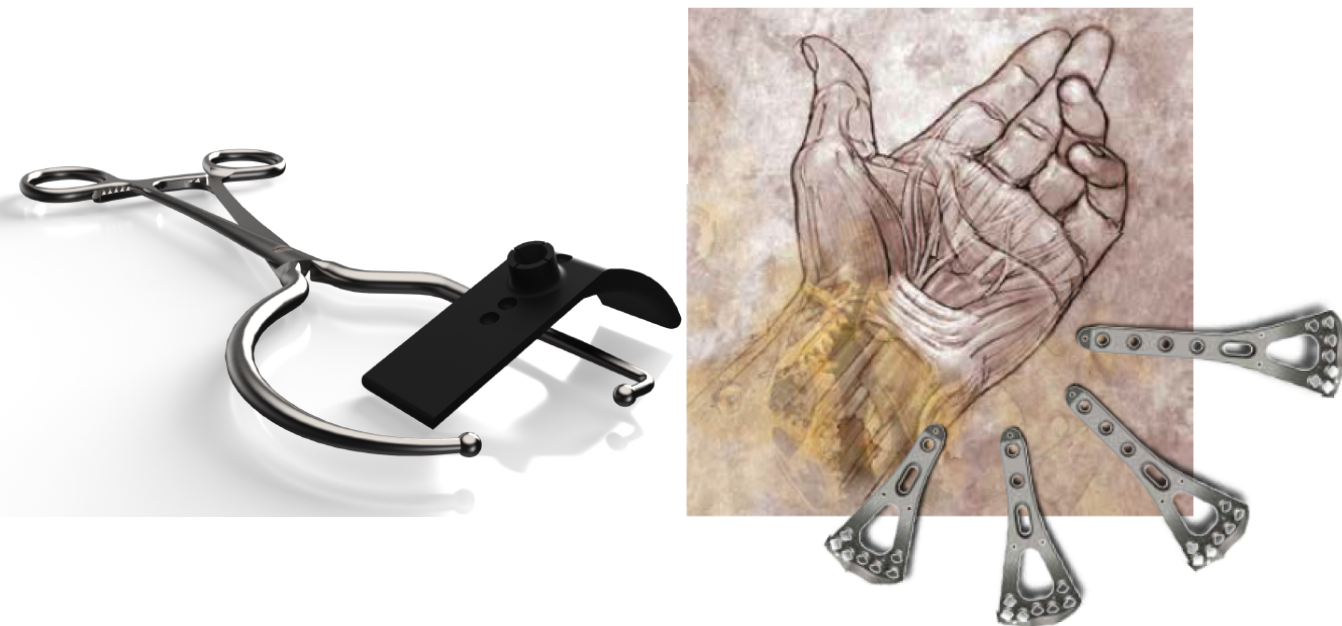
PVDR POLYAXIAL VOLAR DISTAL RADIUS PLATE

RECOMMENDED ORTHOMEDICAL PVDR POLYAXIAL VOLAR DISTAL RADIUS LOCKING PLATE SYSTEM, TITANIUM!